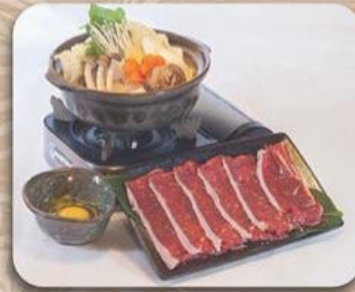
しゃぶしゃぶ / すき焼き Shabu Shabu / Sukiyaki Beef Hot Pot in Shabu Shabu / Sukiyaki Style RM 45.00