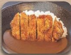
チキンカツカレーライス Chicken Katsu Curry Fried Chicken Cutlet Curry Rice RM 30.00