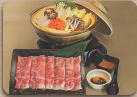
和牛すき焼き/しゃぶしゃぶ Wagyu Sukiyaki/Shabu Shabu 150g Japanese Beef Hot-Pot RM 198.00