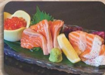
サーモン三種盛り Salmon Sanshumori Assorted of Belly, Roe and Salmon Sashimi RM 42.00