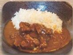
カレーライス(チキン/牛筋) Curry Rice (Chicken/Beef) Curry on Rice (Chicken/Beef) RM 30.00