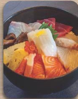
海鮮ちらし丼 Kaisen Chirashi Don Assorted Raw Seafood on Sushi Rice RM 45.00