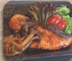
サーモンとキノコのバター焼 Salmon to Kinoko no Battayaki Pan Fried Salmon & Mushroom with Butter Sauce RM 28.00