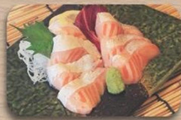
トロサーモン Toro Salmon Salmon Belly RM 35.00