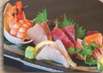
旬 Shun 6 Kinds of Sashimi (2pcs Each) RM 90.00