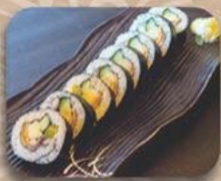
太巻き Futo Maki Japanese Jumbo Roll RM 25.00