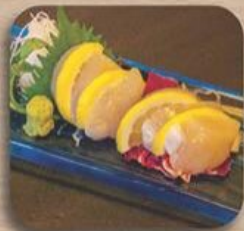
生帆立 Nama Hotate Scallop RM 48.00