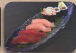
鮪づくし Maguro Zukushi Nigiri Sushi 4pcs + Gunkan 1pc + Hosomaki 1/2pc RM 88.00

*Assortment of Sushi may vary according to seasonal availability. 季節により内容が変更することがあります。