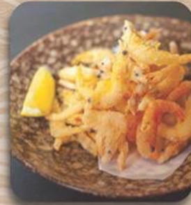
小海老唐揚げ Koebi Karaage Fried Shrimp RM 18.00