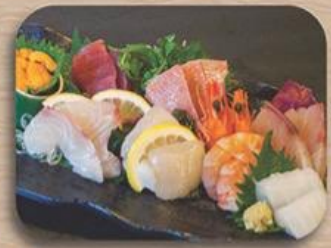
寿 Jyu 8 Kinds of Sashimi (2pcs Each) RM 130.00