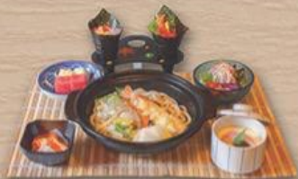
鍋焼うどん/そば手巻き御膳 Nabeyaki Udon/Soba Temaki Gozen Hot pot Udon/Soba with Hand Roll Set RM 47.00