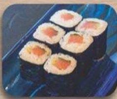
ネギトロ巻 Negitoro Maki Tuna Belly & Spring Onion Roll RM 20.00