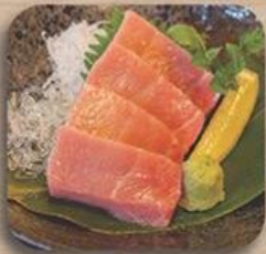
本鯖トロ Honmaguro Toro Tuna Belly 4pcs RM 90.00