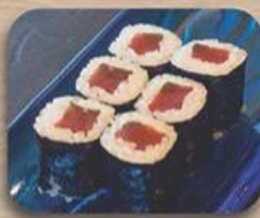
鉄火巻 Tekka Maki Tuna Roll RM 12.00