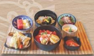
ミニうどんミニサーモン丼御膳 Mini Udon Mini Salmon Don Gozen Mini Udon & Mini Salmon Don Set RM 47.00