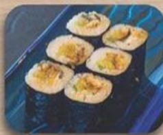
鰻きゅう巻 Unakyu Maki Eel & Cucumber Roll RM 12.00