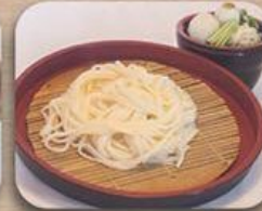
氷見うどん/茶そば(冷/温) Himi Udon/Cha Soba (Cold/Hot) Himi Udon/Cha Soba Noodle (Cold/Hot) RM 23.00