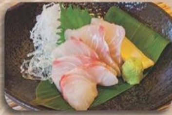
真鯛 Madai Snapper RM 45.00