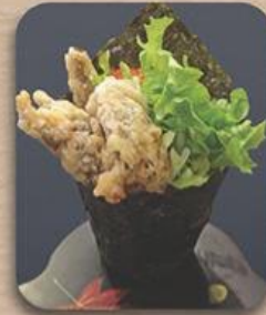
ソフトシェルクラブ手巻 Soft Shell Crab Temaki Soft Shell Crab Hand Roll RM 10.00