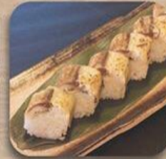
炙りしめ鯖寿司 Aburi Shime Saba Bouzushi Vinegared Mackerel Pressed Sushi Roll RM 20.00