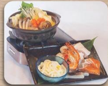
寄せ鍋 Yose Nabe Meat & Seafood Hot Pot RM 58.00