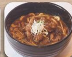
カレーうどん/そば(チキン/牛肉) Curry Udon/Soba (Chicken/Beef) Curry Udon/Soba Noodle RM 25.00