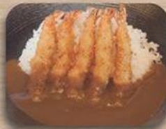
海老フライカレーライス Ebi Fry Curry Fried Prawn Curry/Rice RM 33.00