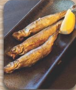
ししゃも Shishamo Grilled Smelt RM 12.00