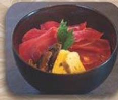
鉄火丼 Tekka Don Raw Tuna Sashimi on Sushi Rice RM 42.00