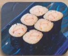
蟹マヨ巻 Kani Mayo Maki Crab Meat Roll with Mayonaise RM 10.00