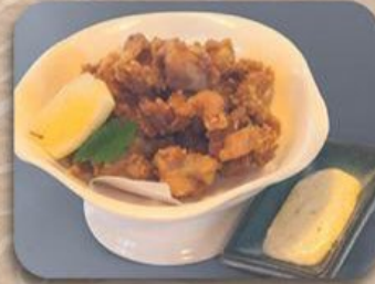
軟骨唐揚げ Nankotsu Karaage Fried Chicken Soft Bone RM 15.00