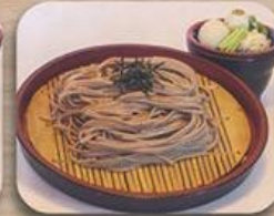
うどん/そば(冷/温) Udon/Soba (Cold/Hot) Udon/Soba Noodle (Cold/Hot) RM 16.00