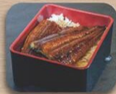
うな重 Unajyu Grilled Eel on Rice RM 40.00 (Half) RM60.00 (Full)