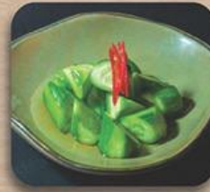
胡瓜の浅漬け Kyuri no Asazuke Marinated Cucumber RM 10.00