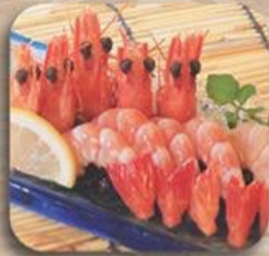
活け海老 Ike Ebi Live Prawn RM 40.00