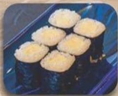
玉子巻 Tamago Maki Japanese Omelette Roll RM 6.00