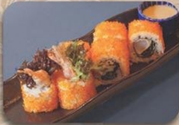
海老天ロール Ebiten Roll Prawn Tempura Roll RM 22.00