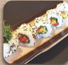
野菜健康ロール Vegetable Healthy Roll Healthy Vege Roll RM 23.00