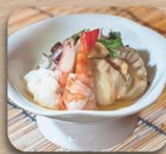
酢の物盛り合わせ Sunomono Moriawase Marinated Assorted Seafood RM 20.00