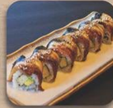
鰻スタミナロール Unagi Stamina Roll Roasted Eel Roll with Omelette & Avocado RM 32.00