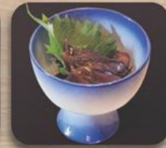
ほたる烏賊沖漬け Hotaruika Okizuke Marinated Hotaruika RM 15.00