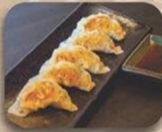
焼き餃子 Yaki Gyoza Grilled Dumplings RM 13.00