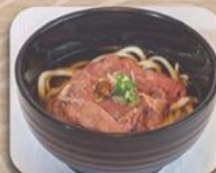
牛肉うどん/そば Niku Udon/Soba Beef Udon/Soba Noodle RM 23.00