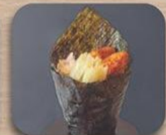
鰻きゅう手巻 Unakyu Temaki Eel & Cucumber Hand Roll RM 10.00