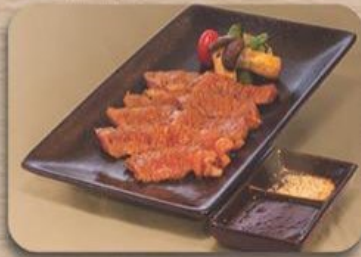
和牛味噌焼き Wagyu Misoyaki 75g Japanese Beef, Served with Pan-fry kit for grill in DIY-style RM 98.00