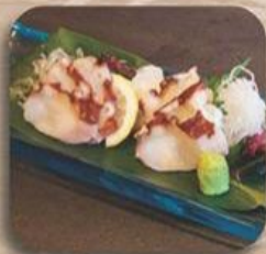
タコ Tako Octopus RM 38.00