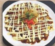
海鮮お好み焼き Kaisen Okonomiyaki Assorted Seafood Japanese Pancake RM 32.00