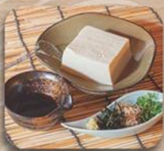
厚焼玉子 Hiyakko Cold Tofu RM 12.00