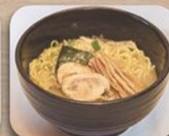
ラーメン Ramen (Shio/Miso) Ramen with Rolled Roasted Chicken & Bamboo Shoots RM 23.00