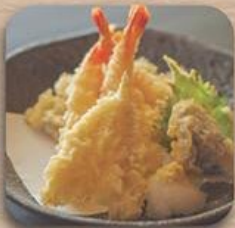
天婦羅盛り合わせ Tempura Moriawase Assorted Tempura RM 25.00