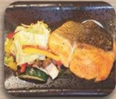
サーモン鉄板焼 Salmon Teppanyaki Grilled Salmon Teppanyaki Style RM 28.00