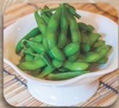
枝豆 Edamame Japanese Green Soy Bean RM 10.00