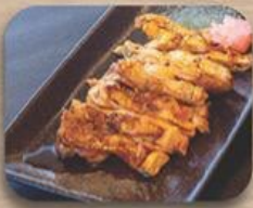
鳥照焼 Tori Teriyaki Grilled Chicken with Teriyaki Sauce RM 22.00