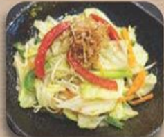
野菜炒め Yasai Itame Assorted Vegetables Teppanyaki Style RM 15.00