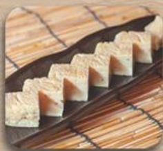
厚焼玉子 Atsuyaki Tamago Japanese Omelette RM 13.00