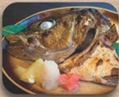
カンパチ兜塩焼/照焼 Kanpachi Kabuto Shioyaki/ Teriyaki Grilled Amberjack Head RM 75.00