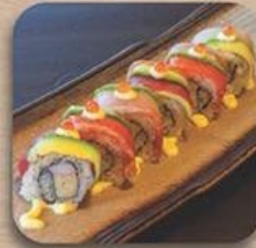
レインボーロール Rainbow Roll Colorful Sushi Roll RM 30.00