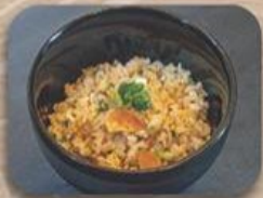
ガーリックライス Garlic Rice Pan-fried Garlic Rice RM 10.00