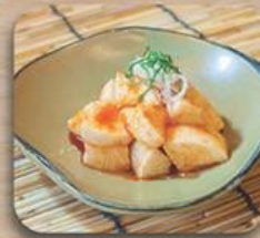
長芋キムチ Nagaimo Kimuchi Japanese Yam marinated with Kimchi RM 15.00