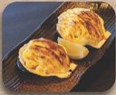
帆立マヨ焼 Hotate Mayoyaki Grilled Scallop with Mayonnaise RM 20.00