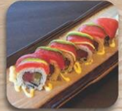
ネギトロたくあんロール Negitoro Takuan Roll Tuna Belly & Spring Onion with Takuan Roll RM 32.00