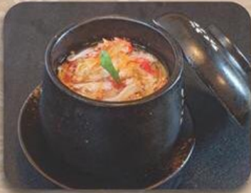
蟹フカヒレ茶碗蒸し Kani Fukahire Chawanmushi Crab Meat & Shark Fin Japanese Steam Egg RM 18.00