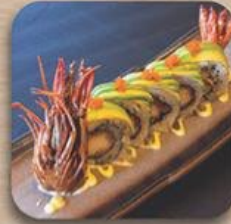
ドラゴンロール Dragon Roll King Prawn Roll RM 32.00