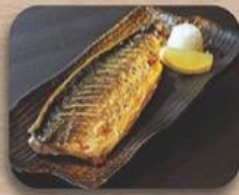
鯖塩焼/照焼 Saba Shioyaki/Teriyaki Grilled Mackerel RM 22.00