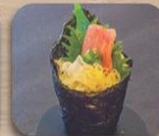
ネギトロ手巻 Negitoro Temaki Tuna Belly & Spring Onion Hand Roll RM 15.00