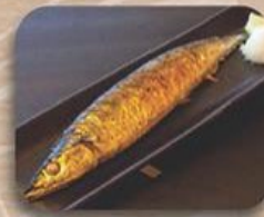
秋刀魚塩焼/照焼 Sanma Shioyaki/Teriyaki Grilled Saury Pacific RM 22.00