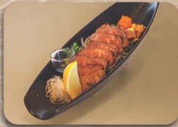
和牛たたき Wagyu Tataki 75g Thinly-Sliced Surface Grilled Japanese Beef RM 98.00