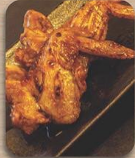
手羽先 Tebasaki Skewered Chicken Wings 2-sticks RM 15.00