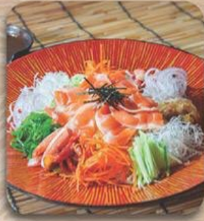
寿楽サラダ Jyuraku Salada RM 28.00 小(S) Japanese Style Yee Sang RM 40.00 大(L)