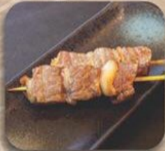
牛肉 Gyu Niku Skewered Beef 2-sticks RM 20.00