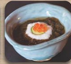
もずく酢 Mozukusu Mozuku Seaweed with Vinegar RM 12.00