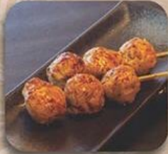
つくね Tsukune Skewered Minced Chicken Ball 2-sticks RM 12.00