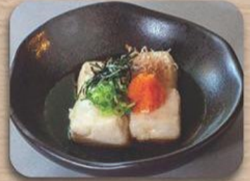
揚げ出し豆腐 Agedashi Tofu Tofu Tempura with Soy Sauce RM 12.00