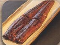
鰻蒲焼 Unagi Kabayaki Grilled Roasted Eel RM 55.00