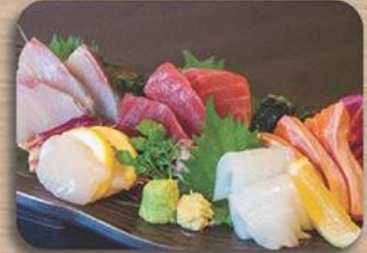
楽 Raku 5 Kinds of Sashimi (3pcs Each) RM 120.00