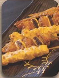
地鶏串焼3串/5串 Jidori Kushiyaki 3sticks/5sticks Skewered Kampung Chicken 3-Sticks/5-Sticks RM 20.00 3串 RM 33.00 5串