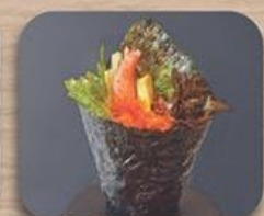
カリフォルニア手巻 California Temaki California Hand Roll RM 9.00