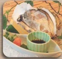
活け生ガキ Ike Nama Kaki Live Oyster 1pc RM 16.00