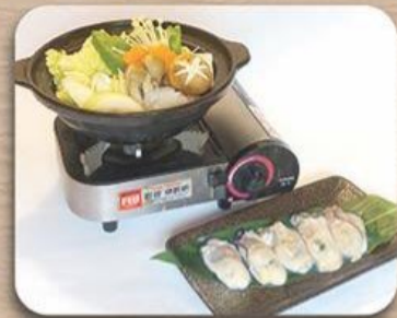
カキ鍋 Kaki Nabe Oyster Hot Pot RM 45.00