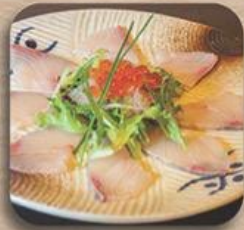
カンパチカルパッチョ Kanpachi Carpaccio Amberjack in Carpaccio RM 45.00