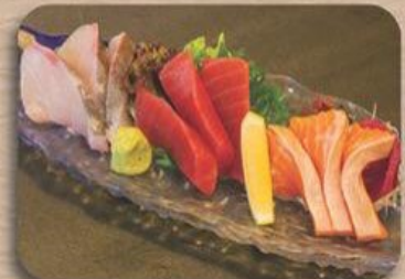
亀 Kame 3 Kinds of Sashimi (3pcs Each) RM 72.00

Assortment of Sashimi may vary according to seasonal availability. 季節により内容が変更することがあります。