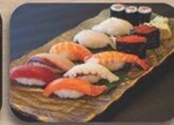
梅 8貫+2軍艦+半細巻 Ume Nigiri Sushi 8pcs + Gunkan 2pc + Hosomaki 1/2pc RM 82.00