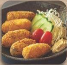
カキフライ Kaki Fry Fried Oyster RM 30.00