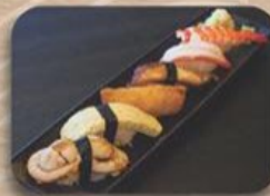
椿 6貫 Tsubaki Cooked Item Nigiri Sushi 6pcs RM 28.00