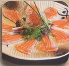
サーモンカルパッチョ Salmon Carpaccio Salmon in Carpaccio RM 35.00