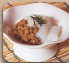
烏賊納豆と長芋 Ika Natto to Nagaimo Cuttlefish & Fermented Soybean RM 18.00