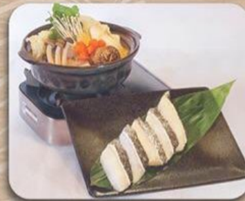
銀鱈湯豆腐 Gindara Yudofu Cod Fish, Tofu & Vegetable in Hot Pot RM 58.00