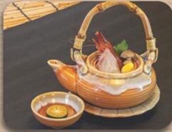
土瓶蒸し Dobinmushi Japanese Clear Soup in Tea Pot RM 20.00