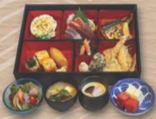
寿楽弁当 Jyuraku Bento Special Bento RM 75.00