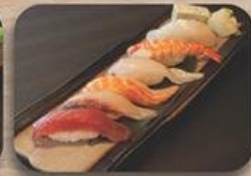
松 6貫 Matsu Nigiri Sushi 6pcs RM 45.00