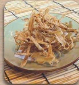
牛蒡素揚げ Gobo Suage Fried Thinly Sliced Burdock RM 10.00