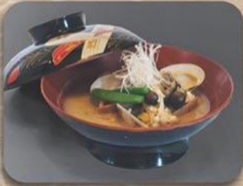
あさり味噌汁 Asari Misoshiru Clam Miso Soup RM 15.00