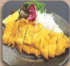
チキンカツフライ Chicken Katsu Fry Fried Chicken Cutlet RM 27.00