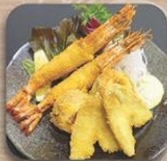
海鮮フライ Seafood Fry Fried Seafood RM 32.00