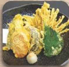
野菜天婦羅 Yasai Tempura Fried Vegetables RM 18.00