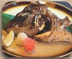
真鯛兜塩焼/照焼 Madai Kabuto Shioyaki/ Teriyaki Grilled Snapper Head RM 30.00