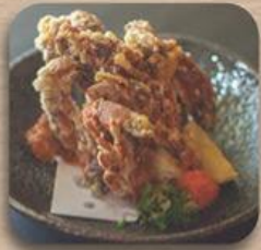
ソフトシェルクラブ揚げ Soft Shell Crab Age Fried Soft Shell Crab RM 28.00