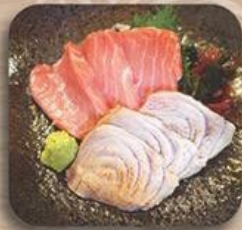
マグロ脂天炙り Maguro Noten Aburi Seared Tuna RM 65.00