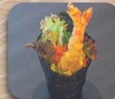
海老天手巻 Ebiten Temaki Prawn Tempura Hand Roll RM 9.00