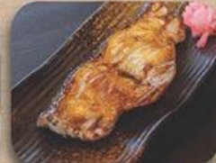
鱈塩焼/照焼 Gindara Shioyaki/Teriyaki Grilled Cod Fish RM 45.00