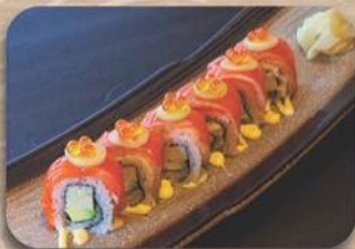
サーモンコーラルロール Salmon Coral Roll Salmon & Avocado Roll RM 23.00