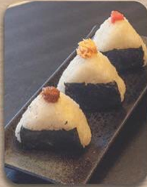
おにぎり(鮭/梅/明太子) Onigiri (Salmon/Plum/Cod Roe) Rice Ball (Salmon/Plum/Cod Roe) RM 8.00/pc