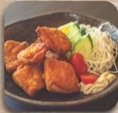
鳥唐揚げ Tori Karaage Fried Chicken RM 22.00