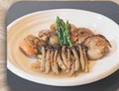
帆立とキノコのバター焼 Hotate to Kinoko no Butteryaki Pan Fried Scallop & Mushroom with Butter Sauce RM 45.00