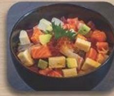
バラちらし丼 Bara Chirashi Don Dice Cut Assorted Seafood on Sushi Rice RM 42.00