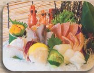
北海 Hokkai 8 Kinds of Sashimi (3pcs Each) RM 200.00