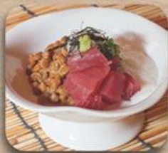
鯖納豆と長芋 Maguro Natto to Nagaimo Tuna & Fermented Soybean RM 20.00