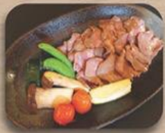
牛タン塩焼 Gyutan Shioyaki Grilled Beef Tongue RM 25.00