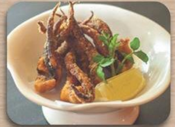
鳥賊ゲン唐揚げ Ikageso Karaage Fried Squid Tentacles RM 16.00