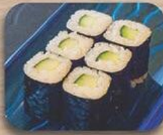
かっぱ巻き Kappa Maki Cucumber Roll RM 6.00