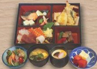
松花堂弁当 Shokado Bento Chirashi Bento RM 65.00

*Pictures shown are for illustration purposes only. イメージです。