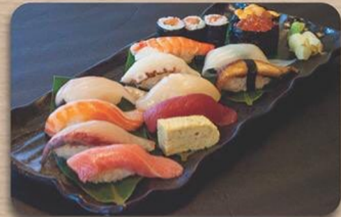
桜 10貫+2軍艦+半細巻 Sakura Nigiri Sushi 10pcs + Gunkan 2pc + Hosomaki 1/2pc RM 120.00