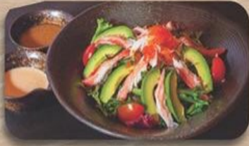
蟹とアボカドサラダ Kani to Avocado Salada RM 23.00 小(S) Crab Meat & Avocado Salad RM 35.00 大(L)