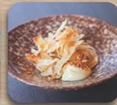
エイヒレ Eihire Grilled Stingray Fin RM 18.00