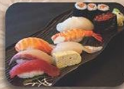
竹 6貫+1軍艦+半細巻 Take Nigiri Sushi 6pcs + Gunkan 1pc + Hosomaki 1/2pc RM 58.00