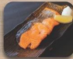
サーモン塩焼/照焼 Salmon Shioyaki/Teriyaki Grilled Salmon RM 22.00