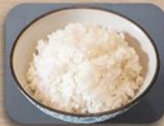
ご飯 Gohan Steam Rice RM 3.00