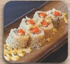
スパイシーサーモンロール Spicy Salmon Roll Salmon Roll with Spicy Mayonnaise RM 23.00