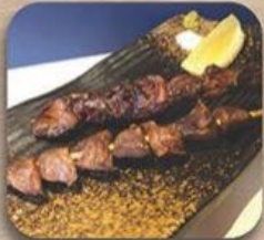
鳥レーバと砂肝 Chicken Liver (1-stick) & Chicken Gizzard (1-stick) Skewered Chicken Liver & Chicken Gizzard RM 10.00