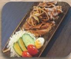
焼肉(牛肉) Yakiniku Grilled Beef RM 28.00