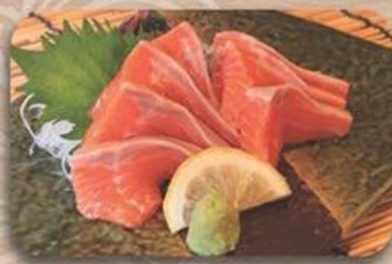
サーモン Salmon Salmon RM 30.00