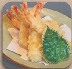
海老天婦羅 Ebi Tempura Prawn Tempura RM 25.00