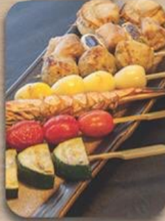
串焼盛り合わせ Kushiyaki Moriawase Assorted Skewered Grills RM 38.00