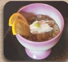
蛸山葵と長芋 Takowasabi to Nagaimo Marinated Raw Octopus with Wasabi RM 10.00