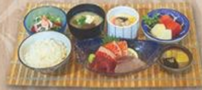
With Sashimi Rice