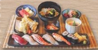
寿司ミニうどん/そば御膳 (冷/温) Sushi Mini Udon/Soba Gozen (Cold/Hot) Sushi with Mini Udon/Soba Set (Cold/Hot) RM 47.00