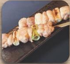
焼き鳥 Yakitori Skewered Chicken 2-sticks RM 12.00