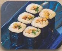
納豆巻き Natto Maki Fermented Soybean Roll RM 6.00