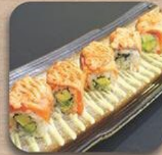
サーモン明太ロール Salmon Mentaiko Roll Salmon & Pollock Roe Roll RM 25.00