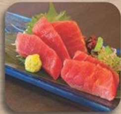
鯖赤身 Maguro Akami Tuna RM 45.00