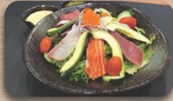
刺身とアボカドサラダ Sashimi to Avocado Salada RM 23.00 小(S) Sashimi & Avocado Salad RM 35.00 大(L)