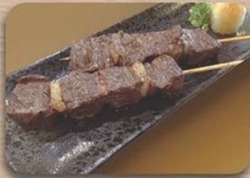
和牛串焼き Wagyu Kushiyaki 100g (2-stick) Skewered Japanese Beef with Salt RM 128.00