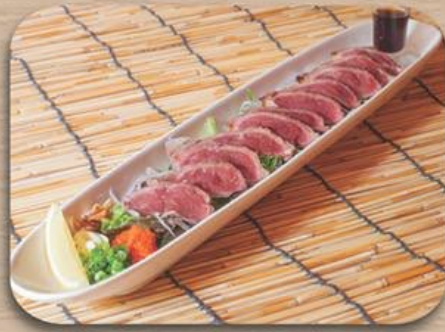
牛肉たたきポン酢 Gyuniku Tataki Ponzu Surface Grilled Beef RM 35.00