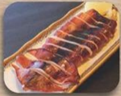
スルメ姿焼 Surume Sugatayaki Grilled Whole Squid RM 28.00