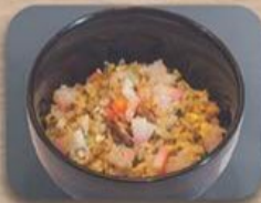
チャーハン Chahan Fried Rice RM 12.00