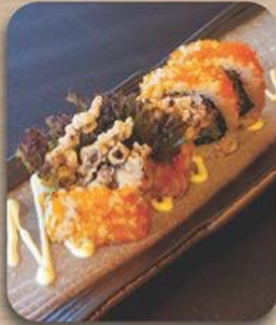
クラブロール Crab Roll Deep Fried Soft Shell Crab Roll RM 22.00