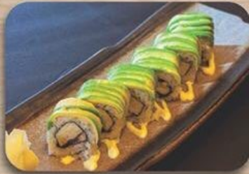
キャタピラーロール Caterpillar Roll Eel & Avocado Roll RM 25.00