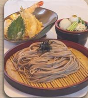
天婦羅うどん/そば(冷/温) Tempura Udon/Soba (Cold/Hot) Tempura Udon/Soba Noodle (Cold/Hot) RM 25.00