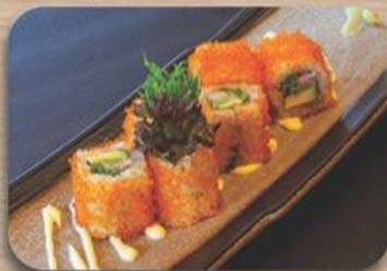
カリフォルニアロール California Roll Crabstick & Avocado Roll RM 22.00