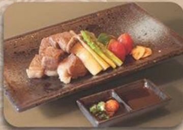
和牛サーロインステーキ Wagyu Sirloin Steak 150g Grilled Japanese Beef Sirloin Steak RM 188.00