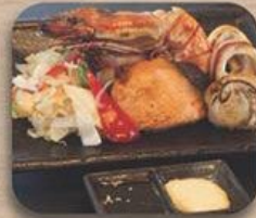
海鮮鉄板焼 Seafood Teppanyaki Assorted Seafood Teppanyaki Style RM 50.00