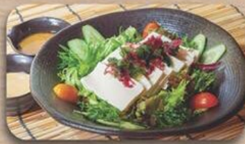
海藻と豆腐サラダ Kaiso to Tofu Salada RM 18.00 小(S) Seaweed & Tofu Salad RM 28.00 大(L)