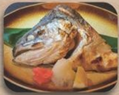
サーモン兜塩焼/照焼 Salmon Kabuto Shioyaki/ Teriyaki Grilled Salmon Head RM 28.00