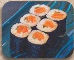
サーモン巻 Salmon Maki Salmon Roll RM 10.00