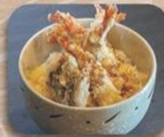
海老天丼 Ebi Ten Don Fried Prawn on Rice RM 28.00