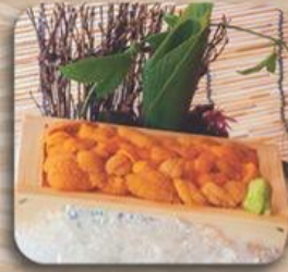
生ウニ Nama Uni Sea Urchin Half Tray / Quarter Tray Seasonal Price