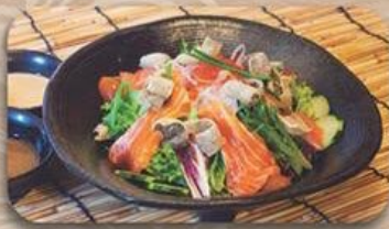
サーモンとイクラサラダ Salmon to Ikura Salada RM 23.00 小(S) Salmon & Salmon Roe Salad RM 35.00 大(L)