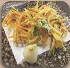
野菜かき揚げ Yasai Kakiage Fried Mixed Vegetables RM 18.00