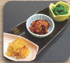
珍味三点盛り Chinmi Santen Mori Chuka Wakame, Idako, Kurage RM 20.00