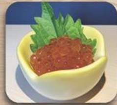
いくら醤油漬け Ikura Shoyuzuke Salmon Roe marinated with Soy sauce RM 32.00