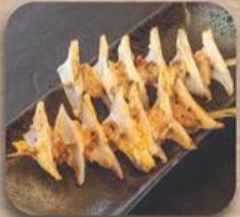
鳥ナンコツ Tori Nankotsu Skewered Chicken Soft Bone 2-sticks RM 12.00