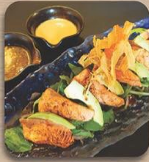
サーモン炙りとアボカドサラダ Salmon Aburi to Avocado Salada Seared Salmon & Avocado Salada RM 30.00