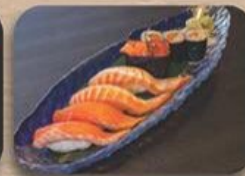
サーモンづくし Salmon Zukushi Nigiri Sushi 4pcs + Gunkan 1pc + Hosomaki 1/2pc RM 40.00