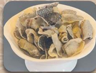
サーモン皮素揚げ Salmon Suage Fried Salmon Skin RM 12.00