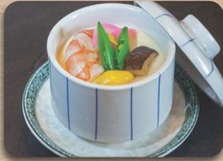
茶碗蒸し Chawanmushi Japanese Steamed Egg RM 10.00