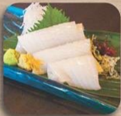
イカ Ika Cuttle fish RM 30.00