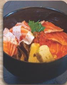
サーモン親子丼 Salmon Oyako Don Salmon & Salmon Roe on Sushi Rice RM 40.00