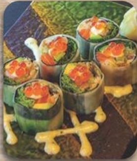
寿楽ロール Jyuraku Roll Restaurant Signature Special Roll RM 33.00