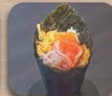
スパイシーサーモン手巻 Spicy Salmon Temaki Salmon with Spicy Mayonaise Hand Roll RM 9.00