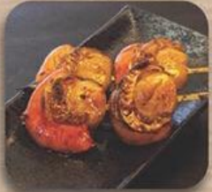
帆立 Hotate Skewered Scallop 2-sticks RM 25.00