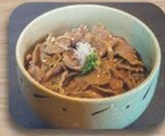
焼肉丼(牛肉) Yakiniku Don Grilled Beef on Rice RM 32.00