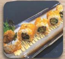
カキロール Kaki Roll Oyster Roll RM 32.00