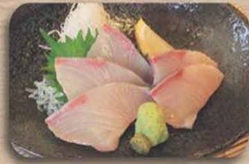
カンパチ Kanpachi Amberjack RM 45.00