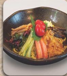
冷やし中華 Hiyashi Chuka Cold Ramen RM 25.00