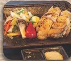
チキン鉄板焼 Chicken Teppanyaki Grilled Chicken Teppanyaki Style RM 27.00