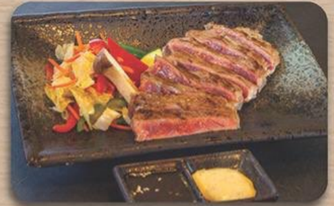
ビーフ鉄板焼 Beef Teppanyaki Sirloin Steak in Teppanyaki Style RM 40.00