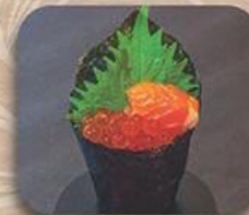
鮭イクラ手巻 Sake Ikura Temaki Salmon with Salmon Roe Hand Roll RM 12.00