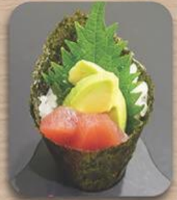
まぐろアボカド手巻 Maguro Avocado Temaki Maguro Avocado Hand Roll RM 10.00