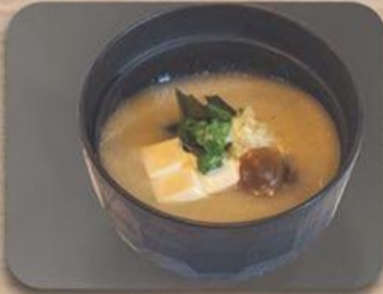
味噌汁 Misoshiru Miso Soup RM 5.00