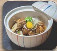
牛すじ煮込み Gyusuji Nikomi Beef Tendon Stew RM 12.00