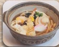
鍋焼きうどん/そば Nabeyaki Udon/Soba Hot Udon/Soba Noodle in Claypot RM 23.00