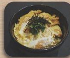
チキンカツ丼 Chicken Katsu Don Chicken Cutlet on Rice RM 28.00