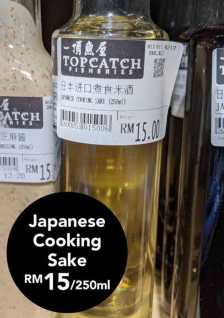
Japanese Cooking Sake RM 15 /250ml