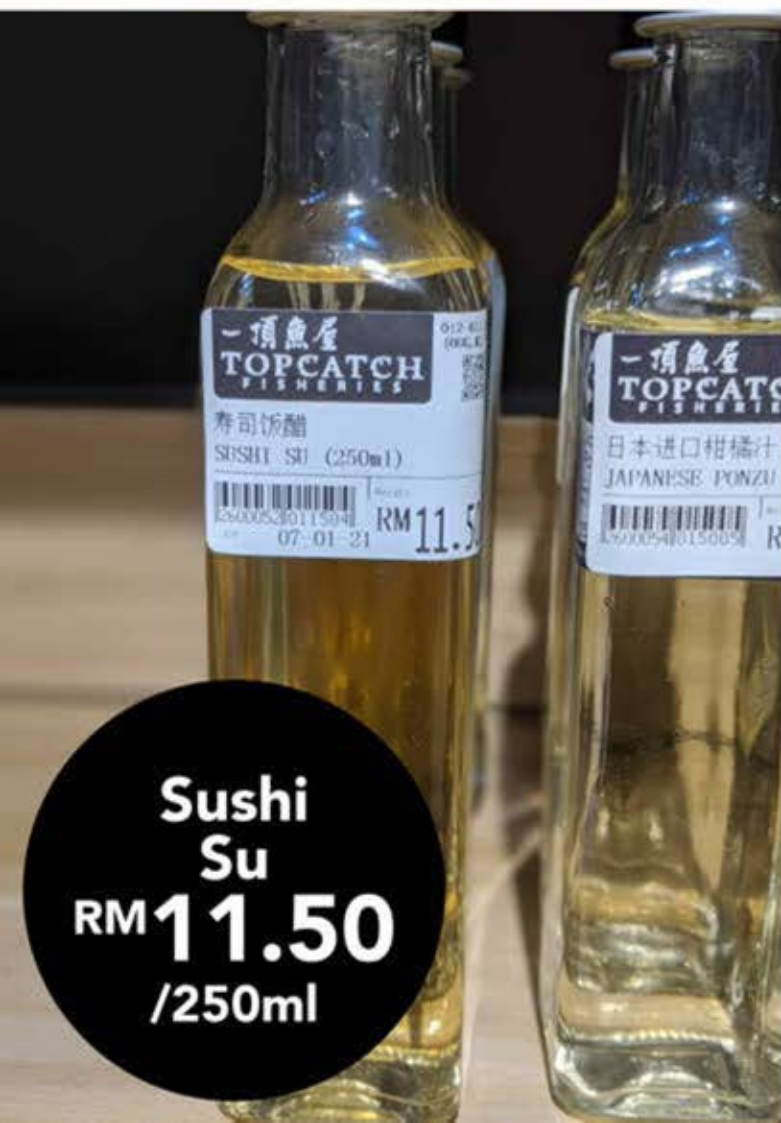
Sushi Su RM 11.50 /250ml