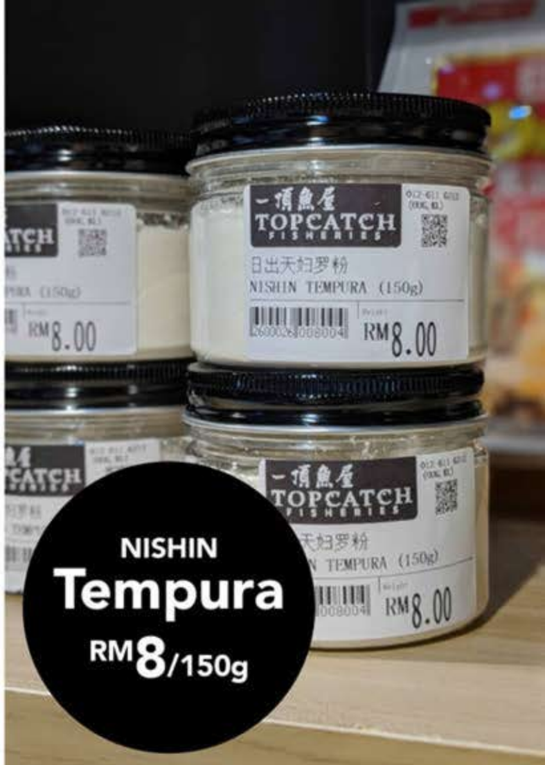
NISHIN Tempura RM 8 /150g