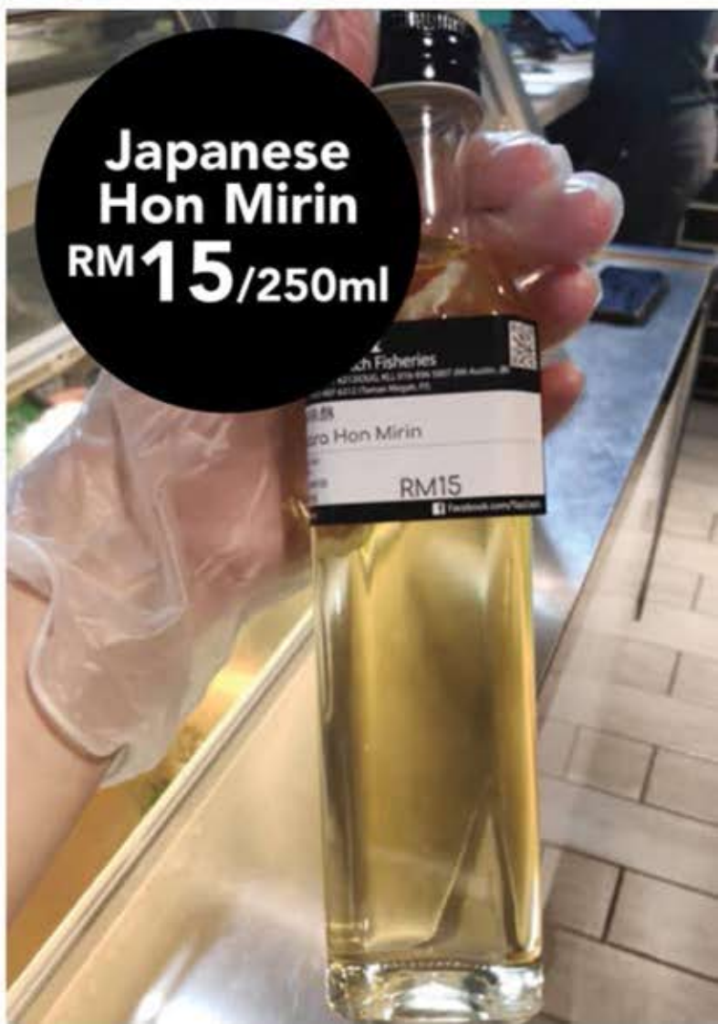
Japanese Hon Mirin RM 15 /250ml